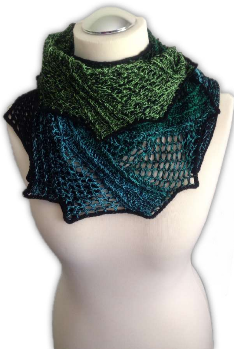
Lizard In the example : Traumgarne Exotica 760m, hook 4 The scarf is 1,83m long